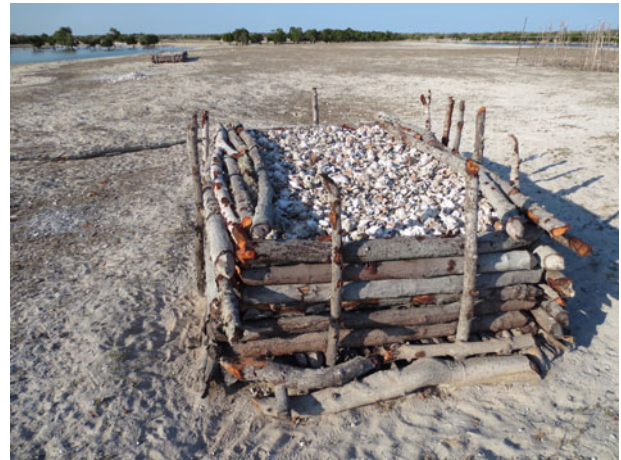
PLATE 2 A lime kiln in the Bay of Assassins.

Changes in lime production and use have important implications for mangroves. Our vegetation surveys show that