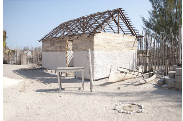
PLATE 1 A house wall with wooden frame and lime render.

Coastal areas in Madagascar are increasingly experiencing in-migration, as poor agricultural households move to the coast seeking more secure livelihoods (Bruggemann et al., 2012). Data are scarce, but there is evidence that the Bay of Assassins is experiencing significant in-migration. For example, in the villages of Lamboara and Ampasilava < 30% of inhabitants were born in those settlements (Epps, 2007). The region's arid climate and the growth in marketing opportunities for marine produce have encouraged people to turn from inland agriculture to coastal fishing