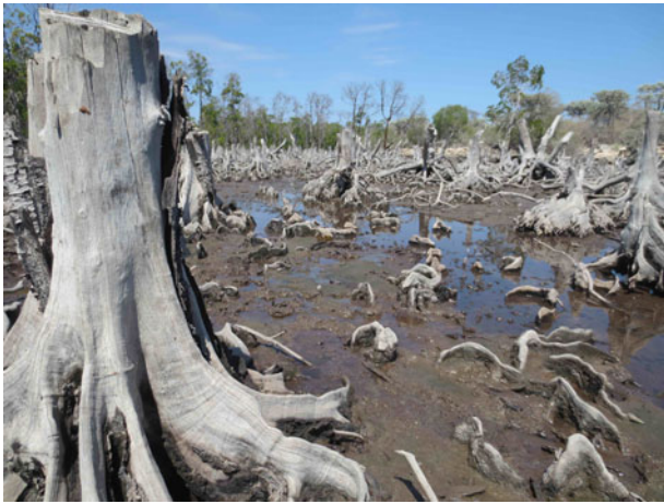
PLATE 3 Clear cutting of Rhizophora mucronata and Ceriops tagal in response to demand for lime in 2013.

differences between households in lime production and consumption, for example according to wealth and migration status. If migration into coastal villages continues, incomes rise, and demand for building timber and lime render grows, how can mangrove harvesting patterns and rates be managed in such a way as to allow mangrove regeneration?